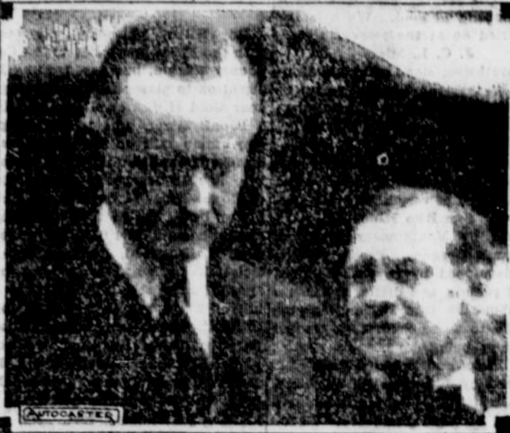
In the first demonstrations this week of sending photographs over long-distance telephone wires, the picture of President Coolidge was transmitted from Cleveland to New York. The telephone company promises regular service of sending pictures in the near future. Also that soon you can step into the nearest long-distance booth and have "Your only one" smile at you as you talk.