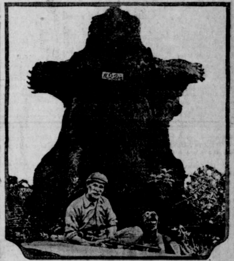
Here is the record grizzly bear killed in Vancouver, and the hunting guide whose trusty rifle brought down the monster.