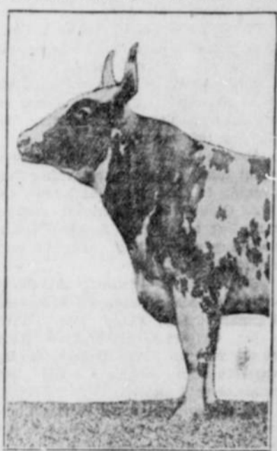
A Good Purebred Bull Will Aid Materially in Increasing Dairy Profits.

Thus it is shown that as production of fat increases, feed cost also increases, but not in proportion, and the income over the feed cost also increases. It costs twice as much to feed the 400-pound fat-producing cow,