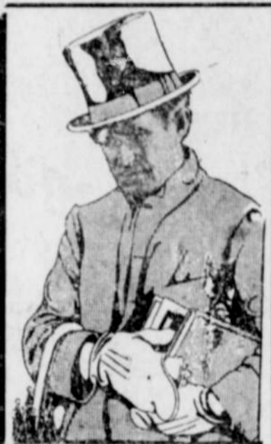
BRAND NEW SHOW TODAY!