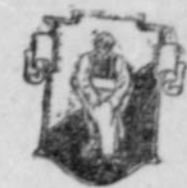
At the sign of Ye Jolly Little Tailor