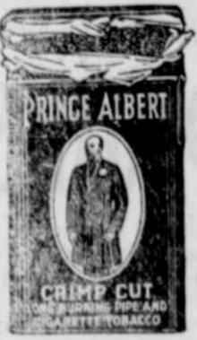
Copyright 1921 by R. J. Reynolds Tobacco Co. Winston-Salem, N. C.

And, besides Prince Albert's delightful flavor, there's its freedom from bite and parch which is cut out by our exclusive patented process! Certainly—you smoke P. A. from sun up till you slip between the sheets without a comeback. Prince Albert is the tobacco that revolutionized pipe smoking. If you never could smoke a pipe—forget it! You can—AND YOU WILL—if you use Prince Albert for packing! It's a smoke revelation in a jimmy pipe or a cigarette!