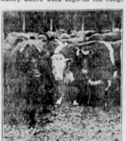
Breeders Show Tendency to Finish Off Their Cattle at Younger Ages.

In the early days of the cattle industry steers were kept on the range