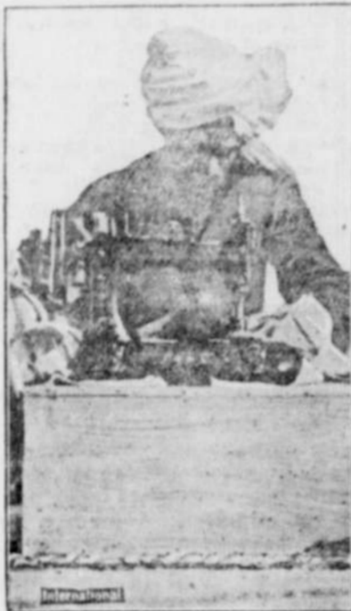
The sewing machine in India. The old pellable method is bounded by no geographical lines.