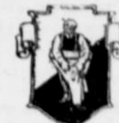
At the sign of Ye Jolly Little Tailor