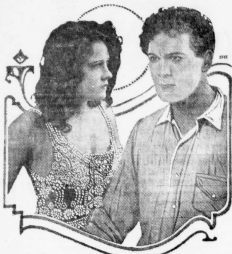
GLORIA SWANSON and THOS. MEIGHAN in Cecil B. DeMille's "Male and Female" A Paramount-Arterraft Picture

Genuineness and absolute realism are two factors in the enormous success which Cecil B. DeMille has attained as a motion picture director. These qualities are present in "Male and Female," Mr. DeMille's latest Paramount-Arterraft picture, which is his famous play, "The Admirable Crichton" and will be on view at the Oregon theater Sunday, Monday and Tuesday. It is Mr. DeMille's desire that every property or furnishing used in his productions be the best that can be bought. Properties used in his latest picture total thousands of dollars in value. One toilet set alone cost five hundred dollars, and the gorgeous gowns worn by Gloria Swanson, Lila Lee and Bebe Daniels, who are in the cast, are worth a handsome price. The story of Crichton, the butler in the family of English nobles who was wrecked with his master's yachting party at sea and became their leader, has long delighted thousands. Under the master hand of Cecil DeMille it is a screen masterpiece. Thomas Meighan plays the leading role, and Theodore Roberts, Raymond Hatton and Guy Oliver are included in the cast.