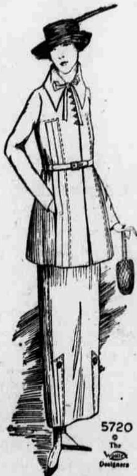
5720 The Designer