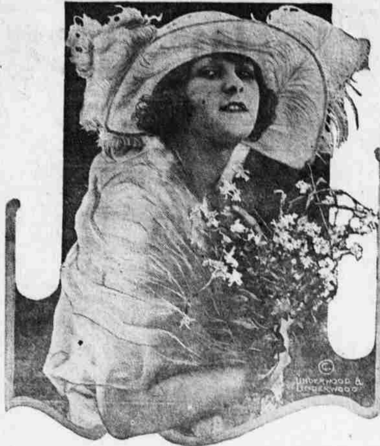
This New Bonnet is as Gay and Charming as the Month of Flowers, With Tender Pink and White Buds. The Hat is a Creation of Pink Georgette and Dancing Blue Ostrich Feathers That Curl and Cling to the Unusual Shape.