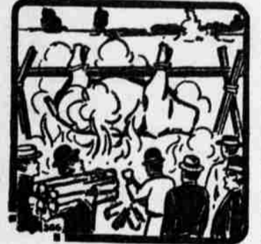
A Roast of Beef!

PRIME ROAST BEEF A Name to Conjure With! Prime—Means Best! ROAST— Is Suggestive of Juiciness, Tenderness, Retention of Flavor! BEEF The King of Meats! For Prime Roast Beef, See Us! OUR MEATS FOR SATURDAY ARE THE BEST QUALITY