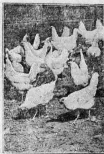
Most Profitable Flock of White Leghorns.

Practically all the Southern Mississippi valley and middle Western states have effected satisfactory increases in their production of poultry products. The emergency agents are now waging a successful campaign against the unprofitable hens by getting owners to cull such fowls from their flocks. Hens which produce less than 75 eggs a year are better dead than alive, while fowls which yield from 75 to 100 eggs annually are only fair producers. Good layers produce 125 eggs and upward every 12 months. In some flocks of 200 hens, 75 of the low-producing fowls have