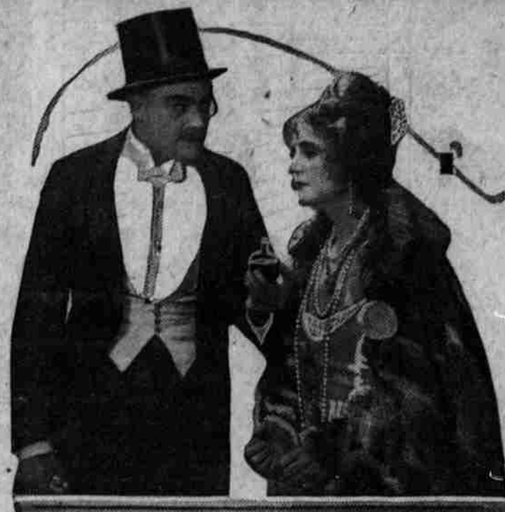
Some of this in his coffee... MAURICE TOURNEUR presents 'SPORTING LIFE'