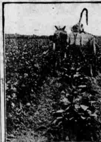
Field of Soybeans, a Good Home-Grown Feed—Rich in Protein for Dairy Cows.

To feed the dairy herds well, with the minimum of grain, substitutes must be furnished for at least part of the grain. With a good pasture during