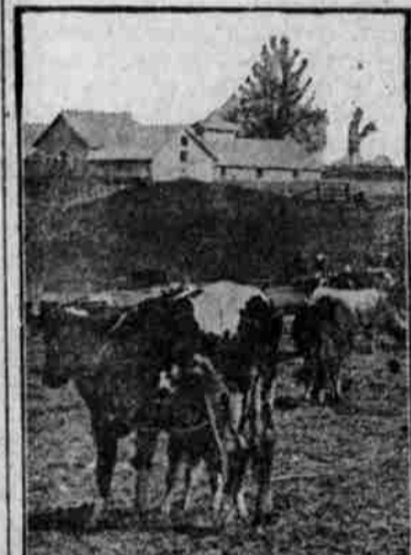
Entire Herd Affected With Bovine Tuberculosis.

The 1919 agricultural appropriation bill just passed by congress contains an item expected to be of great importance in the federal and state campaign to eradicate tuberculosis among cattle and swine.