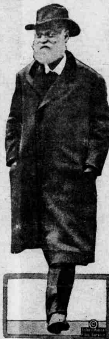
Herr Karl Kautz, leader in German socialistic circles, leaving the chancellor's palace in Berlin after a conference with Premier Ebert.

Valuable Reproof. The reproof of a good man resembles fuller's earth; it not only removes the spots from our character, but it rubs off when it is dry.—Williamson.