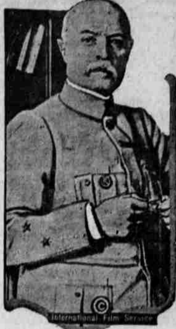
General Fayolle is in immediate command of the French troops that are taking part in the contest for control of the forest of St. Gobain, which protects Laon.