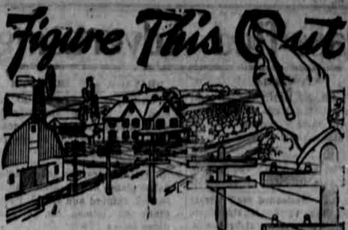
Figure This Out Electricity is the Cheapest Power You can Buy

Electricity is no longer a luxury to be enjoyed by the few. It is now within the reach of the many. Read the following figures based on the average rates for electric current.