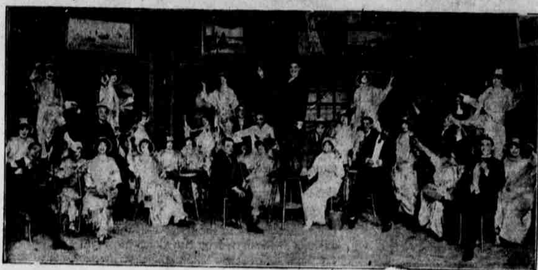
Scene from the musical comedy delight, "September Morn," during the song hit, "Where Is the Pleasure in Wine and Song—If the Woman Is Not There?" coming to the Grants Pass Opera House, Saturday night, May 12th.