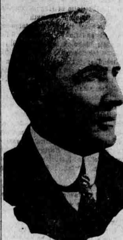
UNITED STATES SENATOR WAR

The dispatches also state that many German cruisers which have heretohibited in this instance. William fore been patrolling the Courland coast have been withdrawn.