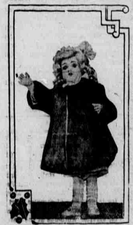
READY FOR SNOW.

Use ordinary window glass cut in the required size and secured by a narrow