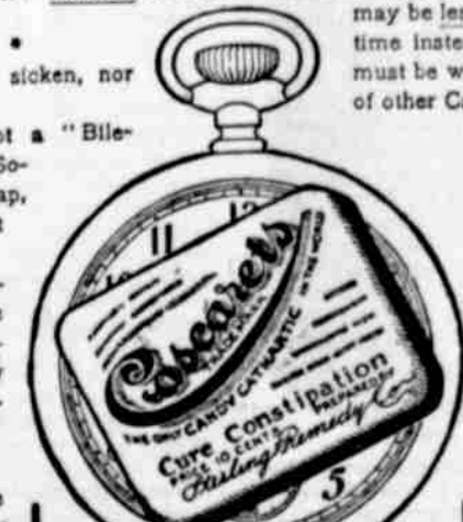
Showing size of "Vest Pocket" Castorets Box compared to Watch.

FREE TO OUR FRIENDS! We want to send to our friends a beautiful French-designed GOLD-PLATED BORDON BOX.