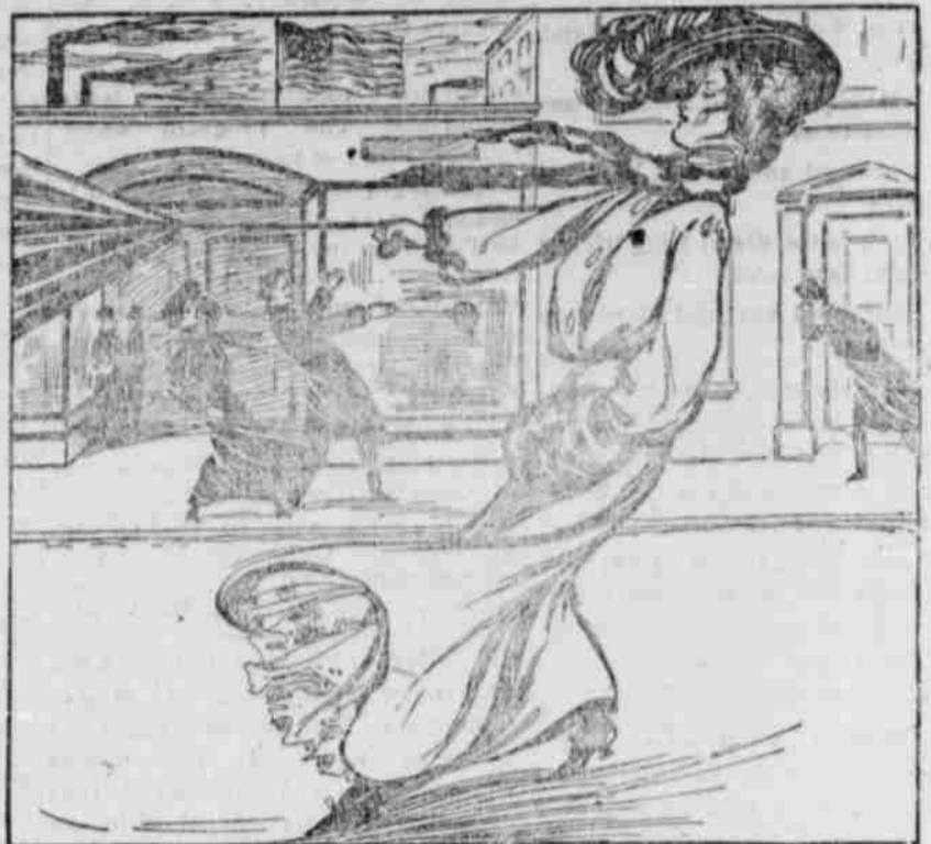
WHAT IS WRONG WITH PICTURE?

There are three things wrong with the above picture. Every person bringing into our store before we close Saturday evening, February 13, the correct solution of the above puzzle will be given a reduction of 10 per cent on the first bill of goods purchased of us, regardless of amount.