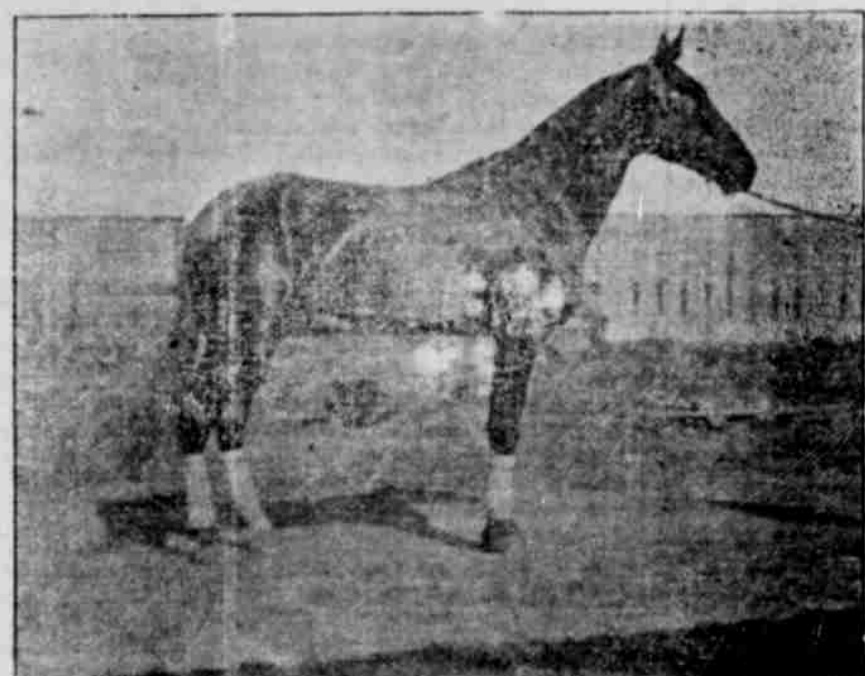
REGISTERED AS PRINCE LOVELACE 32741

ELECTIONEER-WILKES BLOOD IS THE MOST SUCCESSFUL BLEND Lovelace Record 2:20 TRIAL 2:12