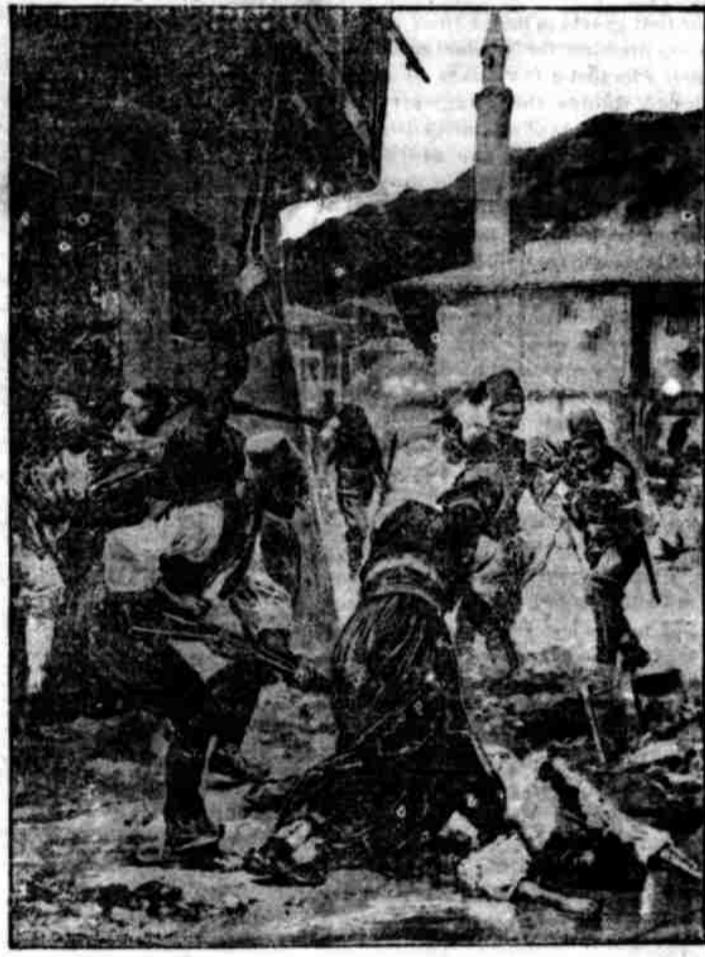
ATTACK ON AN INSURGENT VILLAGE IN MACEDONIA.

Allen B. Aylesworth, Canada's chief representative in the Alaska boundary arbitration proceedings, has long been one of the Dominion's leading legal luminaries. He is a hard worker and a great student. It is said in Canada that he will soon be knighted.