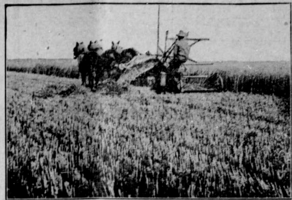
Harvesting Grain With Self-Binder—City People With Farm Experience Are Called Upon to Help Farmers in This Sort of Work.

(Prepared by the United States Department of Agriculture.) To find workers with farm experience to help farmers harvest the wheat crop town organizations, including in many cases those which so successfully conducted the third Liberty Loan and the second Red Cross campaigns, are now uniting their efforts. If the wheat is to be saved, and other needed farm work done, there must be closer co-operation between the town and country. Nonessential industries must permit their employees, who have had farm experience, to go to the country and help during the harvest season.