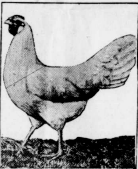
Ideal Type of Leghorn.

Besides being small herself, the average Leghorn produces chicks so small that they do not remain very soft-meated until they have reached the size the market demands in broilers, and so the cockerels cannot be