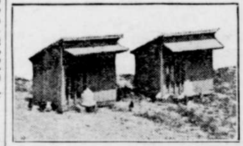
Make the Little Chick's First Home a Comfortable One.

The brood coop should be cleaned at least once a week and kept free from mites. If mites are found in the coop, it should be thoroughly cleaned