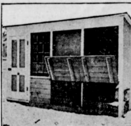
Good Type of Poultry House.

A cheap house 8 by 8 feet square can be made by 2 by 4-inch pieces and 12-inch boards. The 2 by 4 pieces are used for sills, plates, corner posts, and three rafters. No studding is required except that necessary to frame the