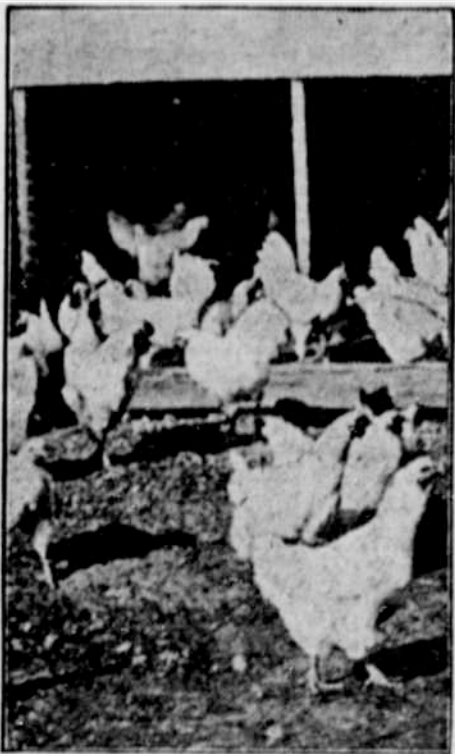
House With Open Front.

Plenty of fresh air and sunshine, along with freedom from drafts and dampness, are the requisites of the ideal poultry house, yet there are many poultrymen who build expen-