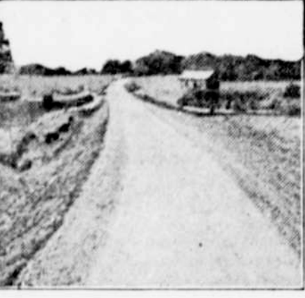
Good Road in West.

Just at this time many are interested in the question, how wide should our public roads be? A number of things should be considered in answering this question, says a writer in Utah Farmer. The kind of material to be used in making the road. The topographical conditions through which the road will pass, the proper drainage of the road. The special use to which the road may be put, if any. For years very little attention has been given to the waste of land in our road building. Land has been cheap and plentiful and years ago we did not