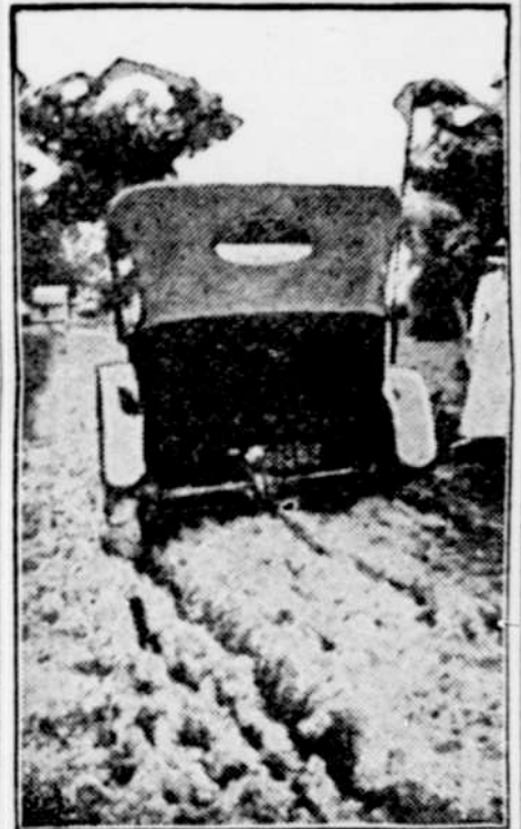
Good Road Needed.

How would such an enormous construction be paid for and kept up? "Suppose," asks this eminent engineer, "the government built 100,000 miles of properly planned roads, and at the same time purchased, say, 300