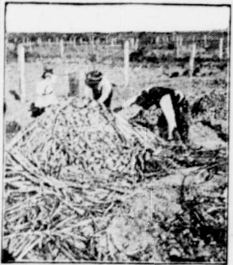
Pit Containing Sweet Potatoes.

Outdoor banks or pits are used very generally for keeping vegetables. The conical pit is used commonly for such vegetables as potatoes, carrots, beets, turnips, salsify, parsnips, and heads of cabbage and is constructed as follows: A well-drained location should be chosen and the product piled on the surface of the ground; or a shallow excavation may be made of suitable