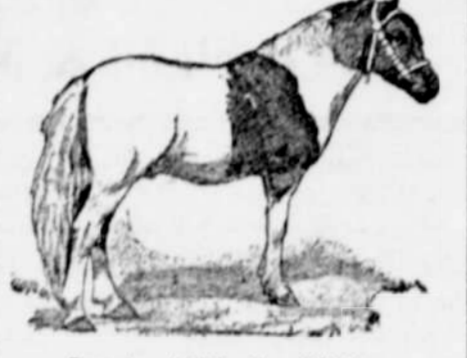
Popular With the Kiddies.

The Shetland pony is always an object of interest, whether seen drawing a shining cart in the city park or bending beneath the cruel weight of his heavy burden on the mountain-trails of his native country. If he were less hardy he could not endure the severe labor he is made to perform in his native land, for there he is purely and simply a burden bearer. Grain, iron, furniture, coal, ore and merchandise of all kinds are transported to all parts of the islands on the backs of the tough little animals. Three hundred pounds is the usual load for each