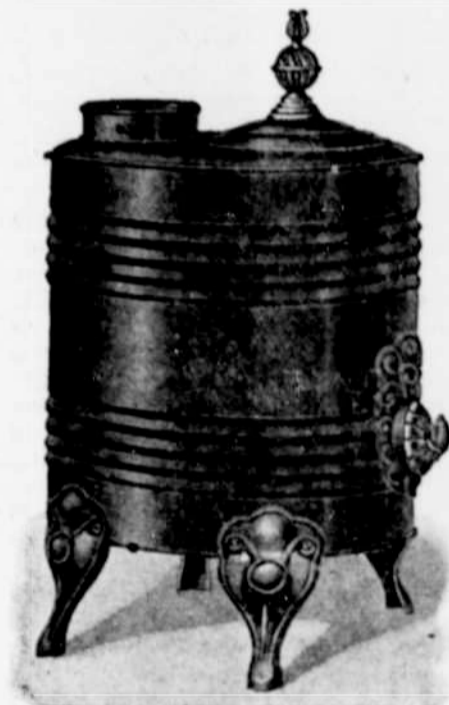
The original COLE'S Air-Tight Stoves

25-inch - $15.00 and $21.00 21-inch - $12.00 and $16.50