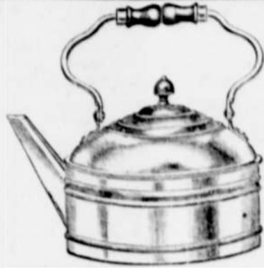
Regular Price, $2.25; our price for this sale $1.75

Forest Grove Phone 683 Goff Bros. Cornelius Phone 284