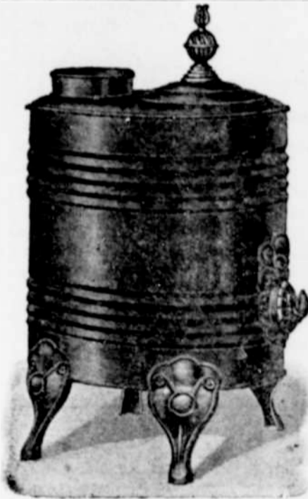
The original COLE'S Air-Tight Stoves 25-inch - $15.00 and $21.00 21-inch - $12.00 and $16.50