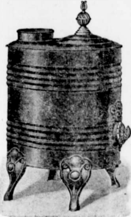
The original COLE'S Air-Tight Stoves 25-inch - $15.00 and $21.00 21-inch - $12.00 and $16.50