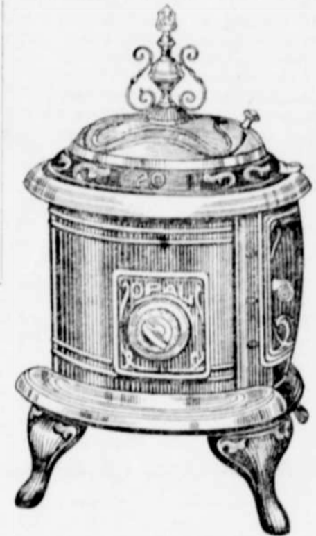
20-inch - $14.75 22-inch - 16.85

is cast-lined, with Heavy cast top and bottom; has swing top feed and extra-large side feed door, to accommodate large pieces of wood.