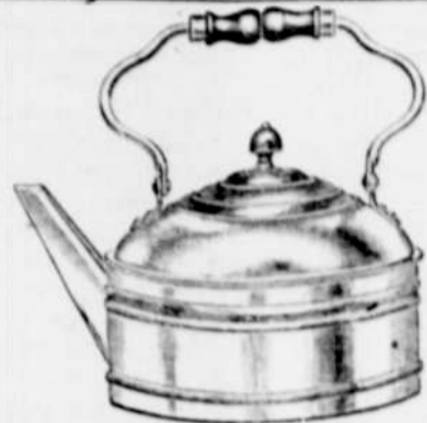
Regular Price, $2.25; our price for this sale $1.75

Forest Grove Phone 683 Goff Bros. Cornelius Phone 284