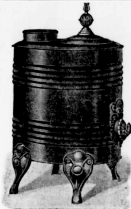
The original COLE'S Air-Tight Stoves 25-inch - $15.00 and $21.00 21-inch - $12.00 and $16.50