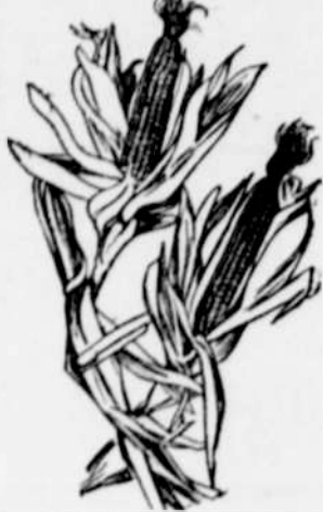
Good Variety of Sweet Corn.

Sweet corn should always be found in the home garden when space allows, since it loses quality very rapidly after being picked. Its sugar changes into starch, so that to have it at its best it should be on the fire within 15 minutes after being pulled from the stalk. Corn does best in a fertile soil, but is able to adapt itself to all textures from sand to clay. To grow it in sufficient quantities for the average family requires more space, however, than for most garden vegetables. It should not be planted until after danger of frost is past. The rows should be spaced not closer than three feet apart, and for