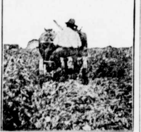
Mowing Cowpea Crop.

Clover requires two years for maturity, cowpeas only three months. A stand of the clover is by no means