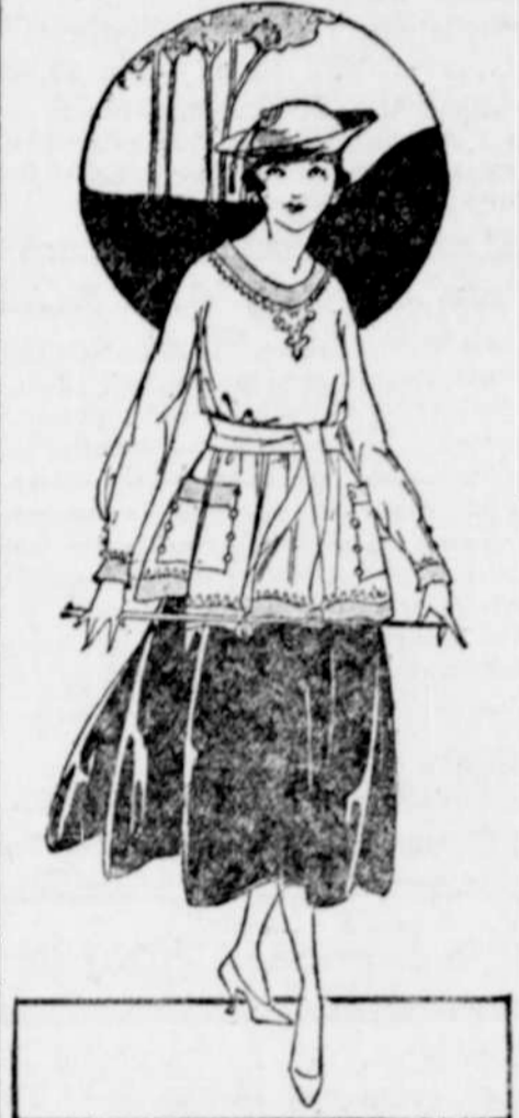
Chinese Note Even in Sweaters.

Many months ago—in fact, with the showing of extreme models in the spring of 1916—a decidedly oriental note was heralded, and a great many garments that borrowed either line or coloring from the far East were shown. In the year that has passed this tendency has grown stronger, and especially the Chinese influences recognized. The summer crop of tub frocks shows many tailored dresses and sport suits with coats or blouses suggest-