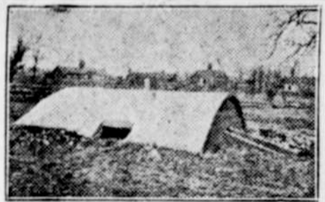
Concrete Fumigating House.

cement to four parts bank-run gravel, or one part cement to two parts sand, to four parts crushed rock. A sack of cement equals one cubic foot. Ventilation should be provided. While building the wall make one or more air shafts (similar to a chimney flue) of 3-inch tile, by imbedding them in the concrete wall, with an opening inside at floor level and another outside, well above ground line. By this arrangement fresh air is admitted. Place a tile chimney in the concrete roof and cover it with a galvanized iron hood for removing the foul air.