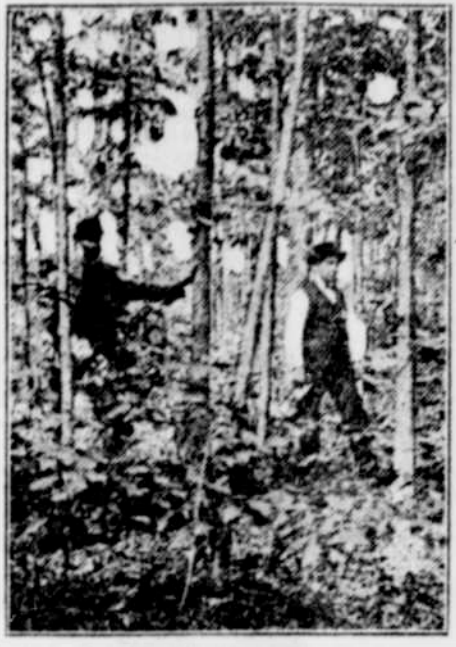
Second Growth White Oak.

The woodlot is convenient in providing fuel, posts, and wood for repairs. It may also serve as a wind-break, and for shelter for stock. On light soils or on steep slopes the trees will bind the soil, to prevent erosion. A woodlot needs proper protection