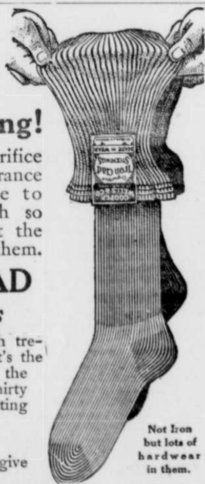
Not Iron but lots of hardwear in them.

They are guaranteed to give satisfaction.