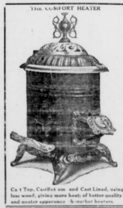
Cast Top, Cast Bottom and Cast Lined, using less wood, giving more heat of better quality and neater appearance than other heaters.

A Rightly Built Stove Will Save Its Price in Heat Efficiency