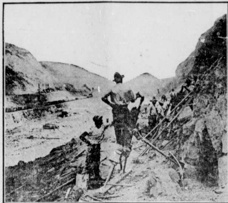
CULEBRA CUT, THROUGH WHICH THE CANAL RUNS.

Pedrarias in 1515 had sent exploring parties to the Pacific side to select a site for a settlement on that coast. The San Francisco expedition therefore in 1515 will be exactly 400 years after this event. It was not until 1519 that the settlement was started, and the founding of the city of Panama