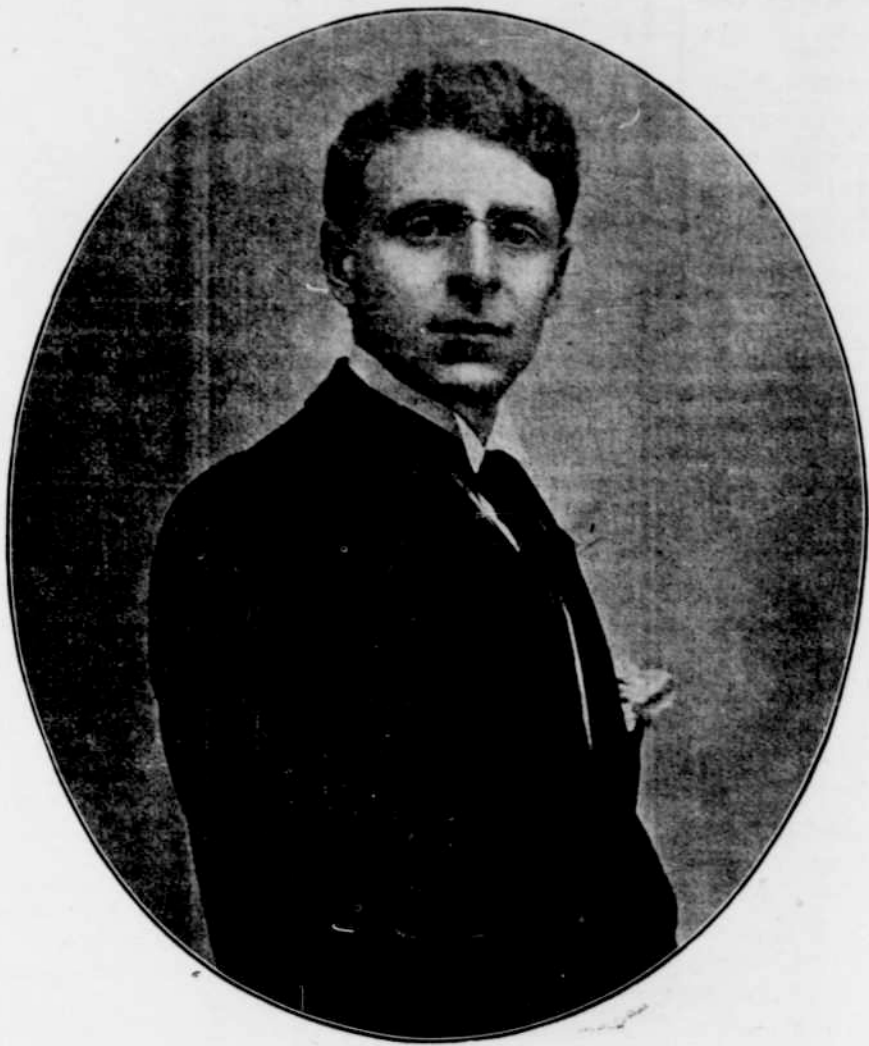
Pacific University Orator who Won State Oratorical Contest at Newberg