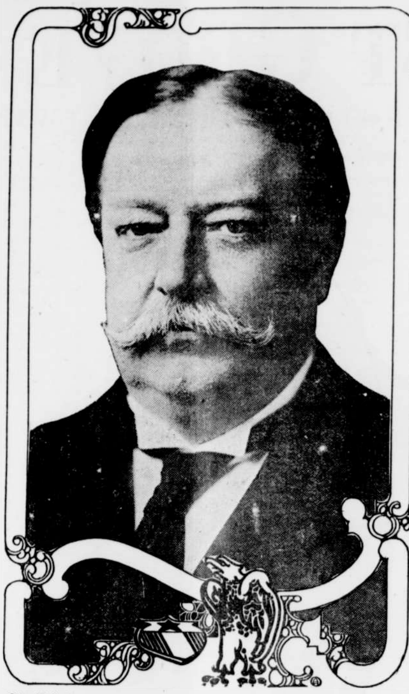
WILLIAM HOWARD TAFT

The only small investment that will bring a big return is the money spent for a result bringing want ad.