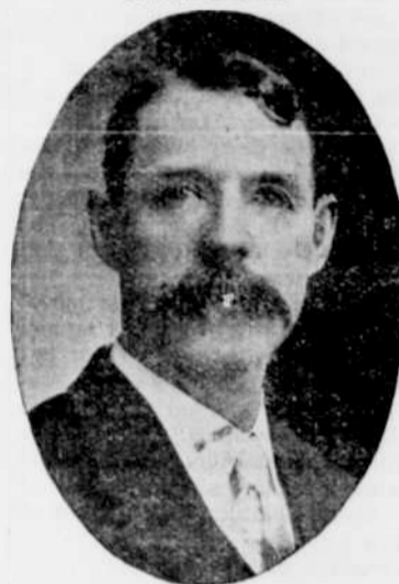
Newly Elected Councilman