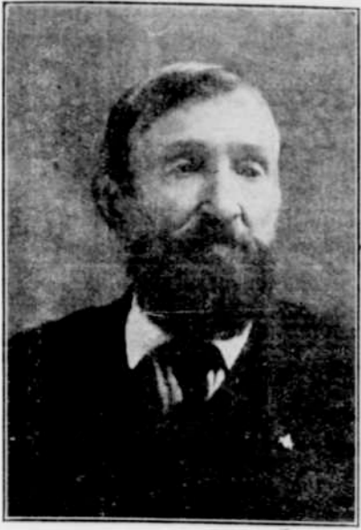
Serving Fortieth Consecutive Term as Tyler of Holbrook Lodge No. 30 A. F. and A. M.