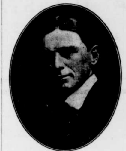
Nominee for City Recorder on Peop'es' Ticket.